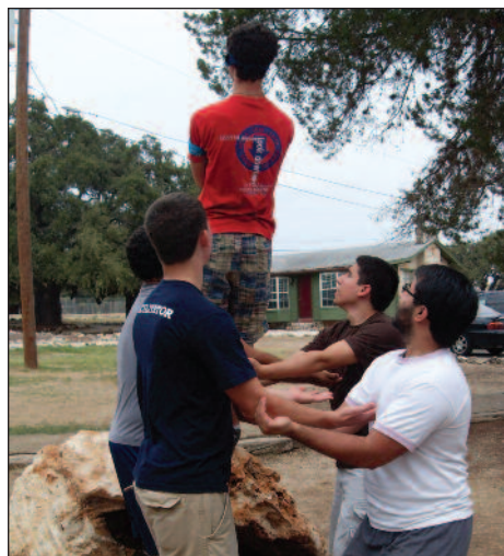
Collegians doing the low ropes and leadership course at their September orientation program. Trust! Falling backwards and being caught!